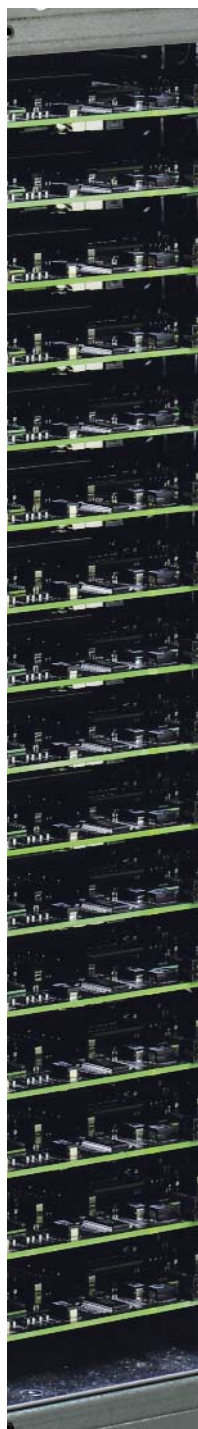
512 Atom processors in a 10 RU SM10000

Simplified Operations: All of the 512 CPUs in a SeaMicro SM10000 can be managed remotely using SeaMicro's redundant management infrastructure. CPU reset and power on/off, installation of new operating system and application software, dynamic modification of load balancer capacity, and system performance monitoring and troubleshooting can be done using a single management API. The management API is built to be integrated into existing operational service systems with minimal effort.